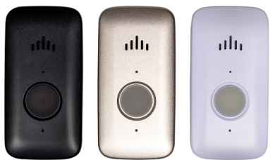
VIPx is available in Black, Silver or White