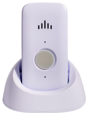
VIPx in Charging Cradle