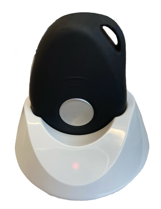
LifeFone VIP Active in Charging Cradle